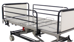
○ Horizontal Rails ($)(7002HR)