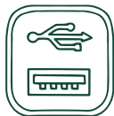
USB Charging Ports