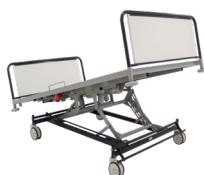
Forward & Reverse Trendelenburg