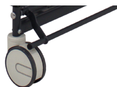
150mm Central Locking Castors