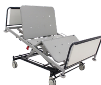
Chair Position Function