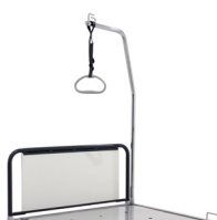
Self Help Pole