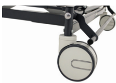
Central Locking Castors