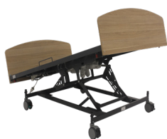
Forward & Reverse Trendelenburg