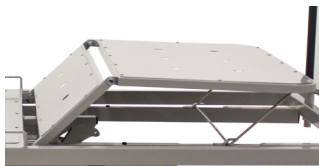
Electric Vascular Support