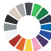
Custom Styles and Colours