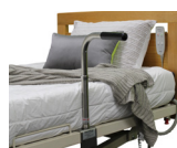
StandEzy Hook Handle