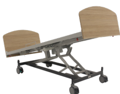
Forward & Reverse Trendelenburg