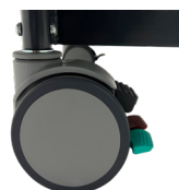
125mm Braking and Directional Castors