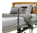
StandEzy Hook Handle