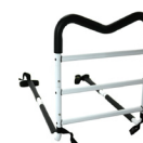
Combo Grab Handle