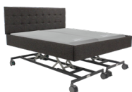
Partner Bed Set Up