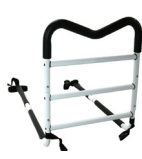
Combo Grab Rail ($)(7-CGH)