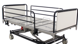
Horizontal Rails ($)(7002HR)