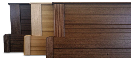
Timber ($) Eltham Style Headboard & Footboard