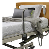
StandEzy Hook Handle Pole ($)(7-SE-HH)