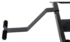
Hi-Lo T-Bar Buffer ($)(7-TBR4000)