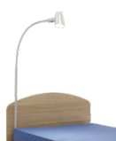
Reading Light ($)(7-ABSL)