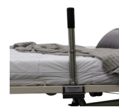
StandEzy Straight Handle Pole ($)(7-SE-SH)