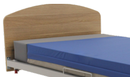
Foam Bolster ($)(7-BLR)