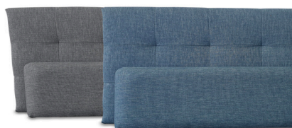
Upholstered ($) Jersey Headboard & Plain Footboard