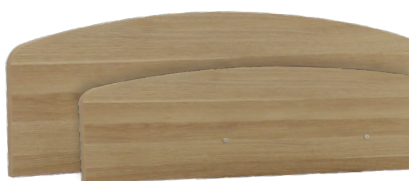
Laminate Curved Headboard & Footboard