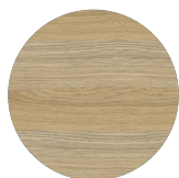
Laminate Natural Oak