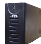
Emergency Power Supply ($)(7-UPS-EBPU-NH)