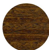
Timber Burnt Walnut