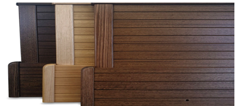
Timber - Eltham Style Burnt Walnut, Beech or Saddle