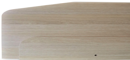
Laminate - Slender Arch Style Natural Oak