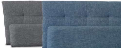
Upholstered - Jersey Headboard & Plain Footboard Ash or Ocean