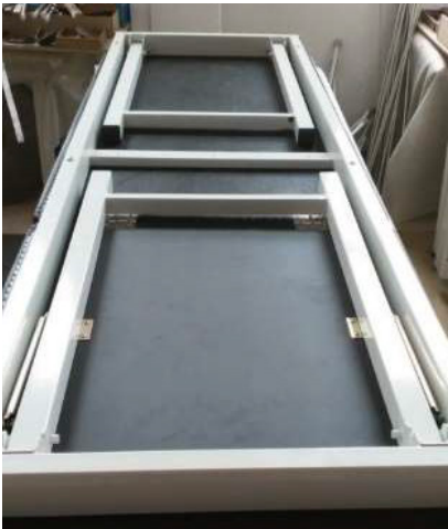
The table is shipped completely assembled (Figure 1)